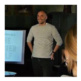
Our workshops empower SMEs to do sustinability for themselves

We also offer sustainability accelerator workshops to instil our customers with a deep understanding of what sustainability is . This helps them to recognise risks, opportunities, and impacts enabling them to articulate their responses without risking greenwashing.